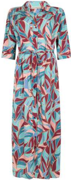
Jess - 316-BPT