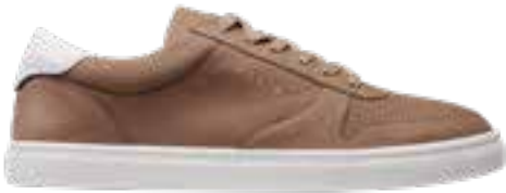
137 SAND NOBUCK UPPER VEGETABLE TANNED LEATHER LINING