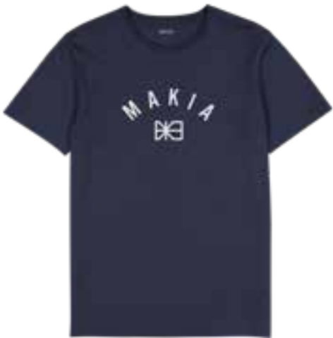
661 DARK BLUE

M21200 | S - XXL | 100% ORGANIC COTTON | 150 g/m² | MADE IN TURKEY