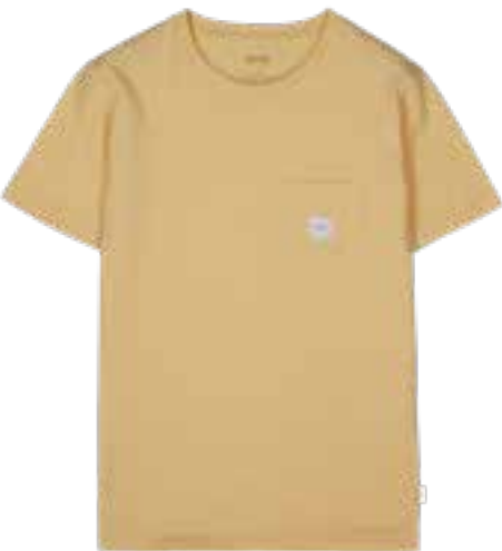
219 LIGHT OCHRE

M24041 | S - XXL | 100% ORGANIC COTTON | 150 g/m² JERSEY | MADE IN TURKEY