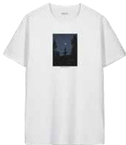
Solstice t-shirt M21334_001 WHITE | S - XXL 100% ORGANIC COTTON | 150g JERSEY MADE IN TURKEY