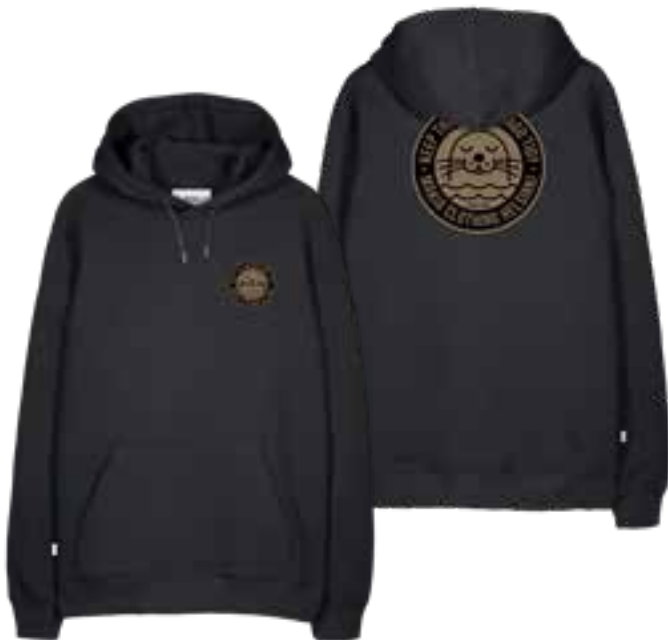
Trunsö hooded sweatshirt CP_U40003_999 BLACK | XS - XXL 100% ORGANIC COTTON | 320g FRENCH TERRY MADE IN TURKEY