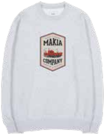
910 LIGHT GREY

M41148 | S – XXL | 100% ORGANIC COTTON | 260 g/m² FLEECE | MADE IN TURKEY