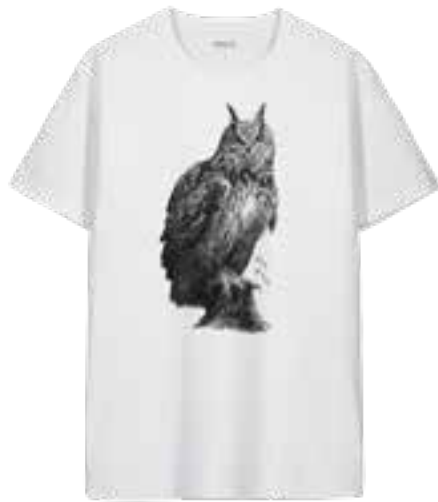
Avem t-shirt M21333_001 WHITE | S - XXL 100% ORGANIC COTTON | 150g JERSEY MADE IN TURKEY