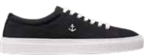
999 BLACK 70% RECYCLED COTTON 30% VISCOSE UPPER 100% MICRO FIBER LINING