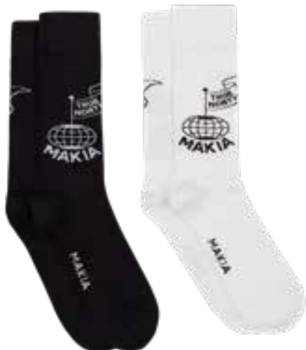
True north two pack of socks

U83004_000 ASSORTED | 35-38, 39-42, 43-46 80% COTTON 18% POLYAMIDE 2% ELASTANE MADE IN PORTUGAL