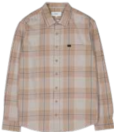
137 LIGHT CAMEL