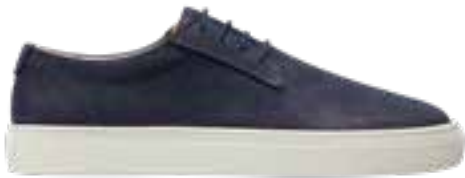
683 NAVY NOBUCK UPPER VEGETABLE TANNED LEATHER LINING

BoroughM90014 | 40-46 | MADE IN PORTUGAL