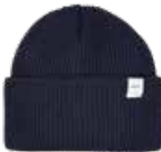
689 DARK NAVY