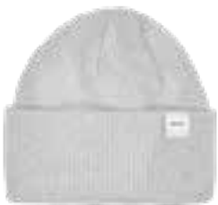
916 LIGHT GREY

U82046 | ONE SIZE | 100% MERINO WOOL | MADE IN FINLAND