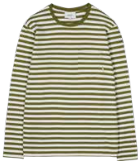
Verkstad long sleeve

M22064_744 GREEN-WHITE | S - XXL 100% ORGANIC COTTON | 220 g/m² INTERLOCK JERSEY MADE IN TURKEY