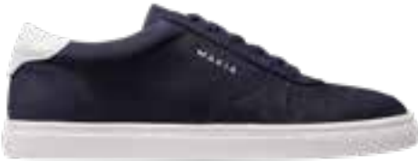
683 NAVY NOBUCK UPPER VEGETABLE TANNED LEATHER LINING