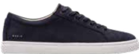
683 NAVY NOBUCK UPPER VEGETABLE TANNED LEATHER LINING

BoroughM90014 | 40-46 | MADE IN PORTUGAL