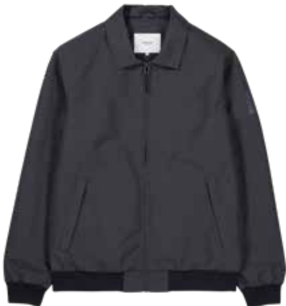
683 DARK NAVY