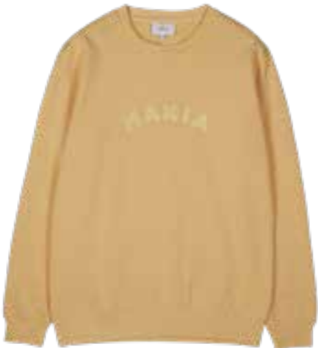
219 LIGHT OCHRE

M41137 | S - XXL | 100% ORGANIC COTTON | 260 g/m² FLEECE | MADE IN TURKEY