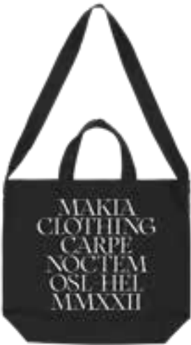
Noctem shoulder tote

U87056_003 ECRU | ONE SIZE 70% RECYCLED COTTON 30% RECYCLED PET MADE IN CHINA