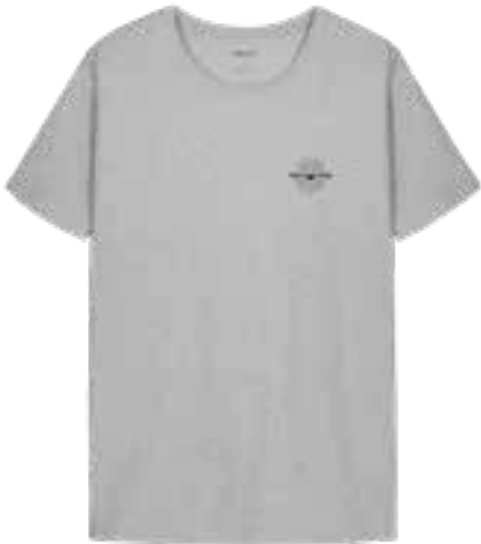
921 LIGHT GREY

M21339 | S – XXL | 60% RECYCLED COTTON 40% RECYCLED PES | 180 g/m² JERSEY | MADE IN INDIA