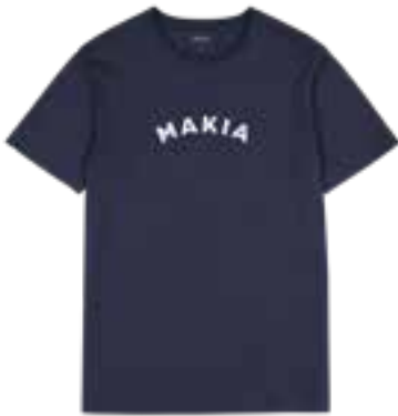
661 DARK BLUE