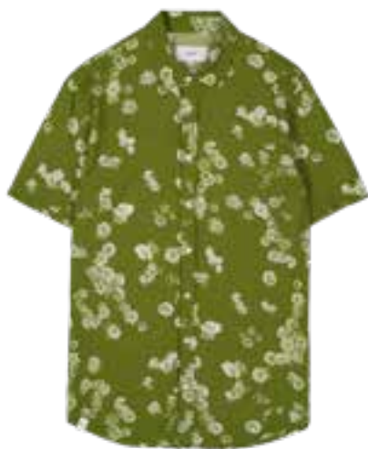
Clover S/S shirt

M61018_126 LIGHT CAMEL | S - XXL 100% ORGANIC COTTON | 165g/m² MADE IN TURKEY