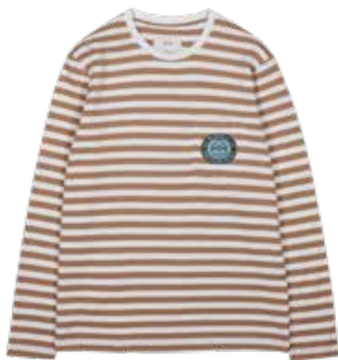
Sandholm long sleeve CP_U22003_137 CAMEL-WHITE | XS - XXL 100% ORGANIC COTTON | 220g INTERLOCK JERSEY MADE IN TURKEY