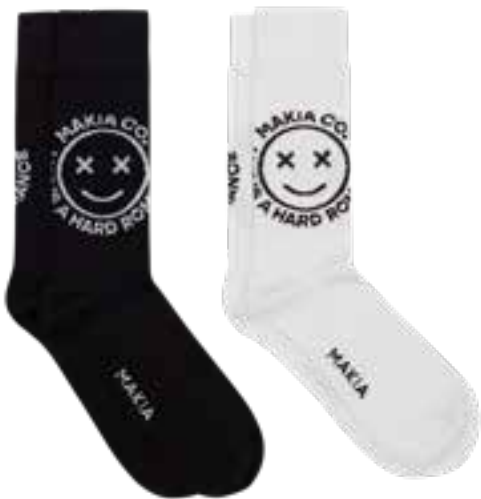
Dizzy two pack of socks

U83003_999 BLACK | 35-38, 39-42, 43-46 80% COTTON 18% POLYAMIDE 2% ELASTANE MADE IN PORTUGAL