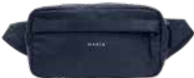
661 DARK BLUE