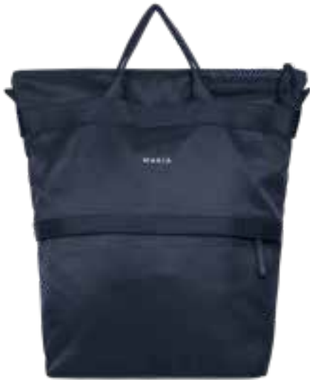
661 DARK BLUE