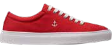
457 RED 70% RECYCLED COTTON 30% VISCOSE UPPER 100% MICRO FIBER LINING