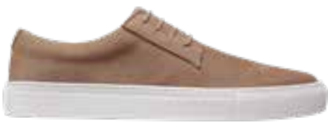
137 SAND NOBUCK UPPER VEGETABLE TANNED LEATHER LINING