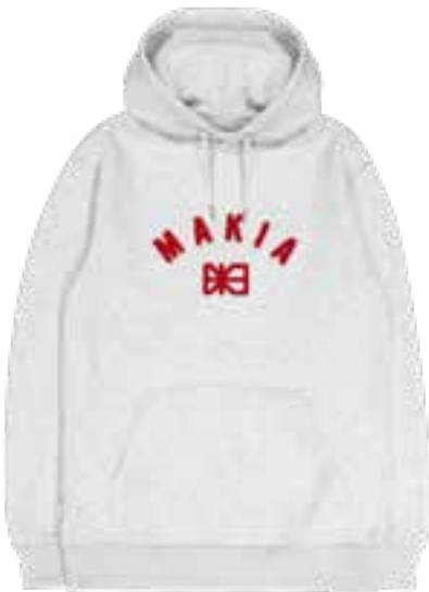
910 LIGHT GREY