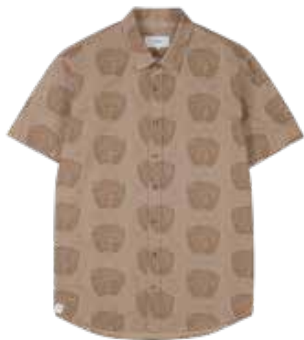
Mink S/S shirt

M61018_126 LIGHT CAMEL | S - XXL 100% ORGANIC COTTON | 165g/m² MADE IN TURKEY