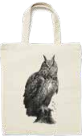
Avem tote bag

M21337_999 BLACK | S - XXL 100% ORGANIC COTTON | 150g JERSEY MADE IN TURKEY