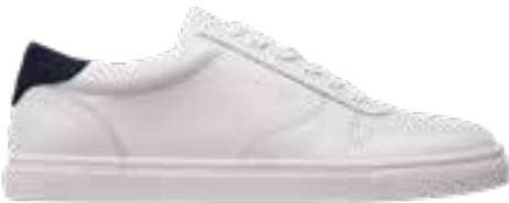
001 WHITE LEATHER UPPER VEGETABLE TANNED LEATHER LINING