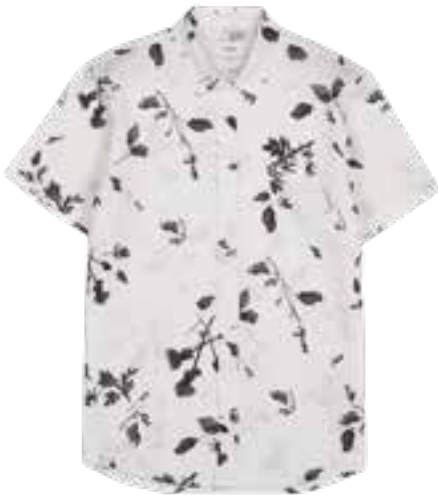
Folium S/S shirt M61020_031 WHITE | S - XXL 100% LYOCELL TENCEL | GABARDIN 160g/m² MADE IN TURKEY