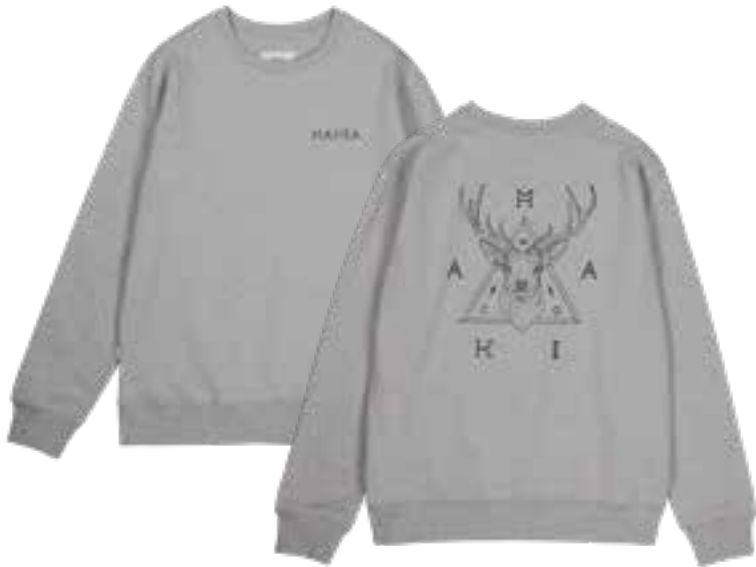
921 LIGHT GREY

M41144 | S – XXL | 60% RECYCLED COTTON 40% RECYCLED PES | 280 g/m² FLEECE | MADE IN INDIA