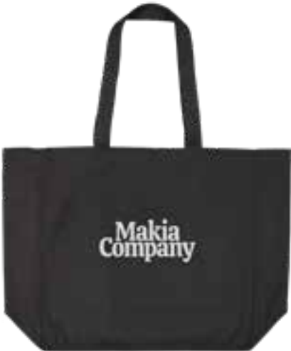
999 BLACK 100% COTTON