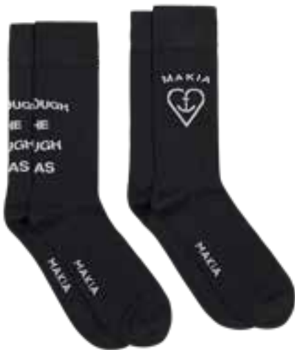
Glenn two pack of socks

U83001_999 BLACK | 35-38, 39-42, 43-46 80% COTTON 18% POLYAMIDE 2% ELASTANE MADE IN PORTUGAL