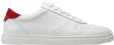
000 WHITE-RED LEATHER UPPER VEGETABLE TANNED LEATHER LINING