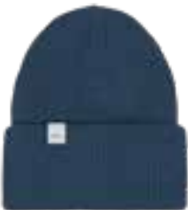
665 NORDIC BLUE

U82093 | ONE SIZE | 100% ORGANIC COTTON | MADE IN TURKEY