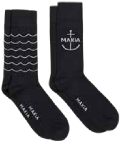
Frey two pack of socks

U83001_999 BLACK | 35-38, 39-42, 43-46 80% COTTON 18% POLYAMIDE 2% ELASTANE MADE IN PORTUGAL