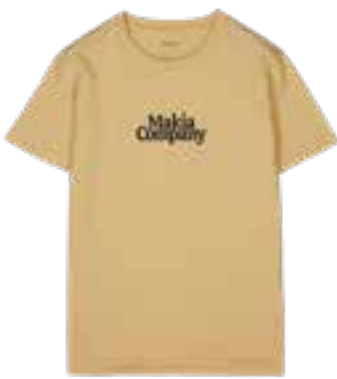
219 LIGHT OCHRE