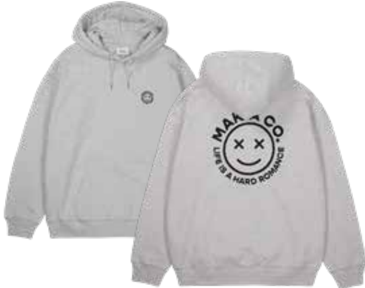
910 LIGHT GREY