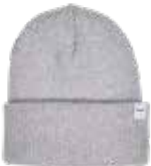
914 LIGHT GREY

U82055 | ONE SIZE | 100% ORGANIC COTTON | MADE IN TURKEY