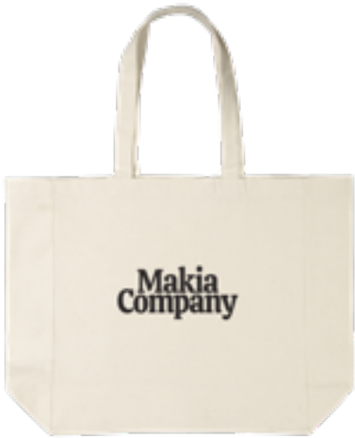
003 ECRU 70% RECYCLED COTTON 30% RECYCLED PET PLASTIC