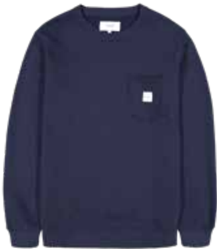
661 DARK BLUE