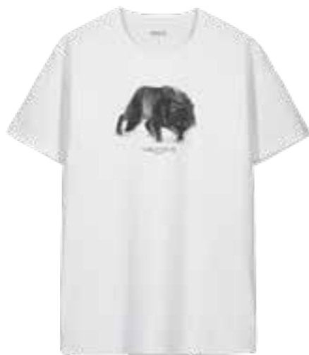
Lupus t-shirt M21332_001 WHITE | S - XXL 100% ORGANIC COTTON | 150g JERSEY MADE IN TURKEY