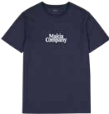
661 DARK BLUE