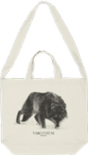
Lupus shoulder tote

U87054_999 BLACK | ONE SIZE 100% COTTON | MADE IN CHINA