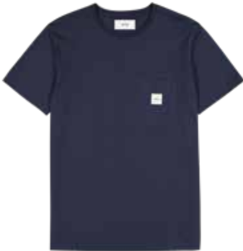
661 DARK BLUE