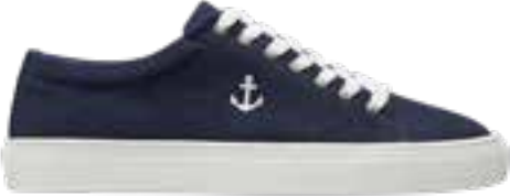
661 DARK BLUE 70% RECYCLED COTTON 30% VISCOSE UPPER 100% MICRO FIBER LINING