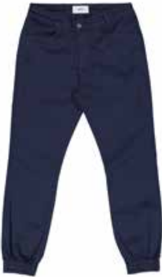
670 DARK NAVY