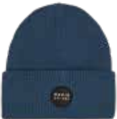
665 NORDIC BLUE