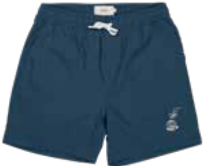
665 NORDIC BLUE