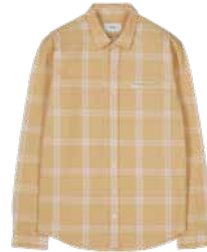
219 LIGHT OCHRE

M60141 | S - XXL | 100% ORGANIC COTTON | 157g/m² | MADE IN TURKEY