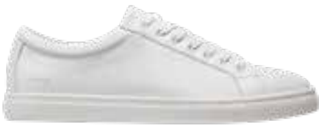
001 WHITE LEATHER UPPER VEGETABLE TANNED LEATHER LINING