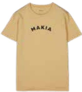
219 LIGHT OCHRE