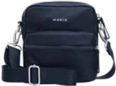
661 DARK BLUE