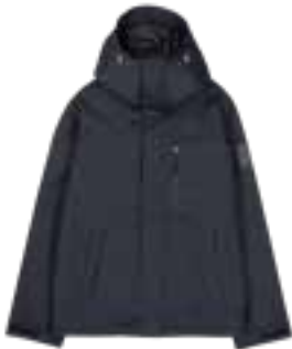
683 DARK NAVY