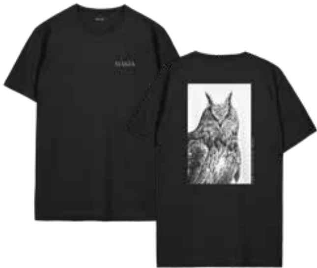
Hubro t-shirt M21335_999 BLACK | S - XXL 100% ORGANIC COTTON | 150g JERSEY MADE IN TURKEY