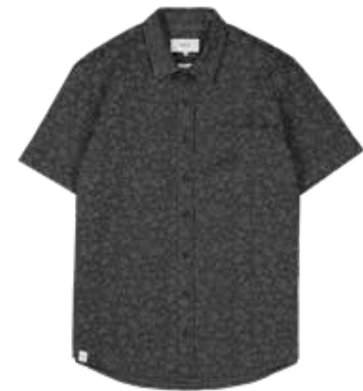
Saimaa S/S shirt

M61019_974 DARK GREY | S - XXL 100% ORGANIC COTTON | 120g/m 2 MADE IN TURKEY