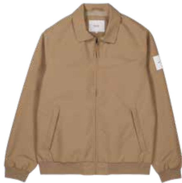
137 LIGHT CAMEL