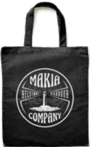
999 BLACK 100% COTTON