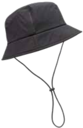
126 LIGHT CAMEL