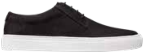
998 BLACK NOBUCK UPPER VEGETABLE TANNED LEATHER LINING