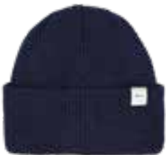
689 DARK NAVY