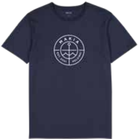
661 DARK BLUE

M21260 | S - XXL | 100% ORGANIC COTTON | 150 g/m² | MADE IN TURKEY