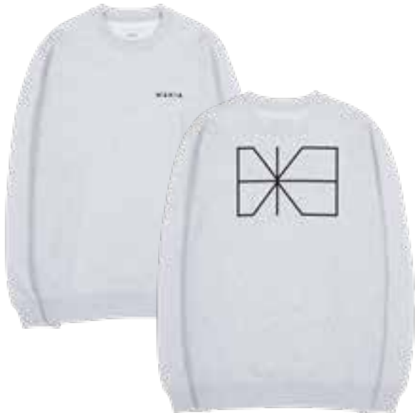
910 LIGHT GREY