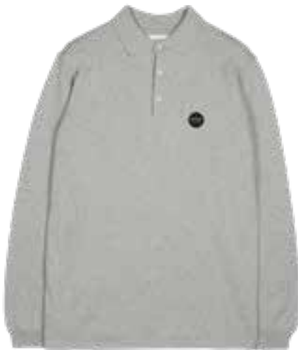
914 LIGHT GREY