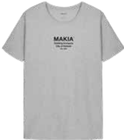
921 LIGHT GREY