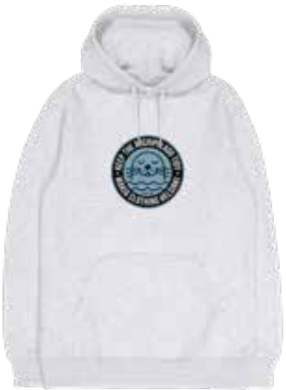
Klobben hooded sweatshirt CP_U40004_910 LIGHT GREY | XS - XXL 100% ORGANIC COTTON | 320g FRENCH TERRY MADE IN TURKEY