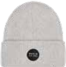
914 LIGHT GREY