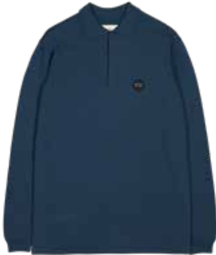
665 NORDIC BLUE

M50063 | S - XXL | 100% ORGANIC COTTON | 14 GAUGE KNIT | MADE IN TURKEY