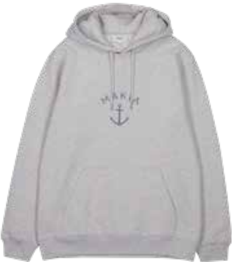
910 LIGHT GREY