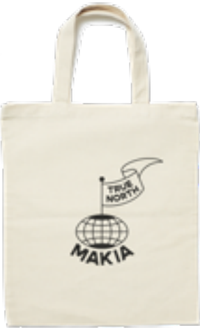
North tote bag U87059_003 ECRU | ONE SIZE 70% RECYCLED COTTON 30% RECYCLED PET MADE IN CHINA