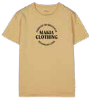
219 LIGHT OCHRE