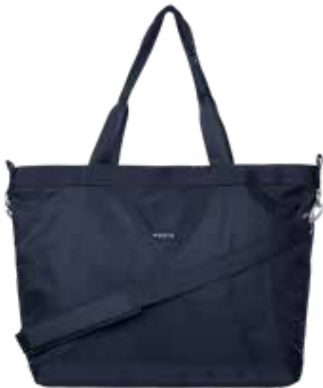
661 DARK BLUE