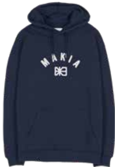
661 DARK BLUE

M40079 | S – XXL | 100% ORGANIC COTTON | 360 g/m² FLEECE | MADE IN TURKEY