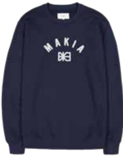
661 DARK BLUE