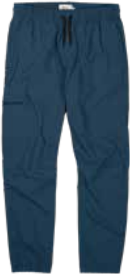
665 NORDIC BLUE

M70015 | 30, 32, 34, 36 | 64% COTTON 31% POLYESTER 5% ELASTANE | 155g/m² | MADE IN TURKEY