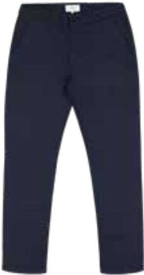
659 DARK NAVY