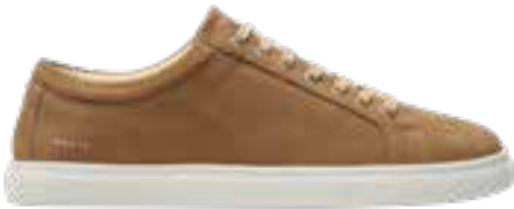
137 SAND NOBUCK UPPER VEGETABLE TANNED LEATHER LINING