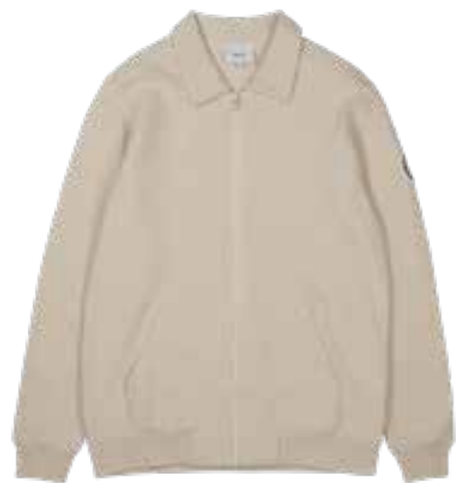
122 LIGHT BEIGE

M41142 | S – XXL | 100% ORGANIC COTTON | 300 g/m² POLAR FLEECE | MADE IN TURKEY