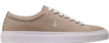
127 KHAKI 70% RECYCLED COTTON 30% VISCOSE UPPER 100% MICRO FIBER LINING