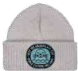
916 LIGHT GREY

CP_U82003 | ONE SIZE | 100% MERINO WOOL | MADE IN FINLAND