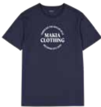
661 DARK BLUE