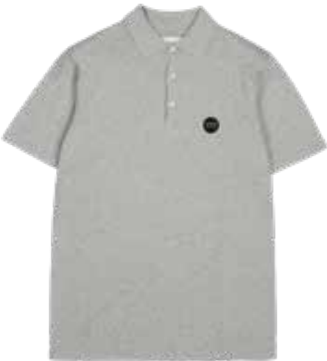
914 LIGHT GREY