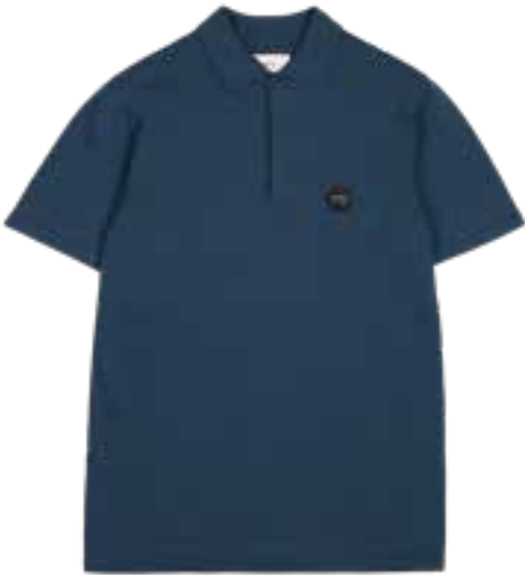
665 NORDIC BLUE

M24062 | S – XXL | 100% ORGANIC COTTON | 14 GAUGE KNIT | MADE IN TURKEY