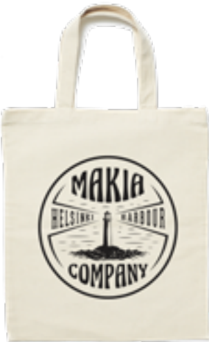
003 ECRU 70% RECYCLED COTTON 30% RECYCLED PET PLASTIC