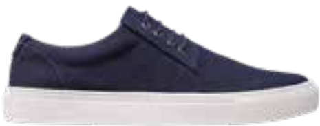
661 DARK BLUE 70% RECYCLED COTTON 30% VISCOSE UPPER 100% MICRO FIBER LINING