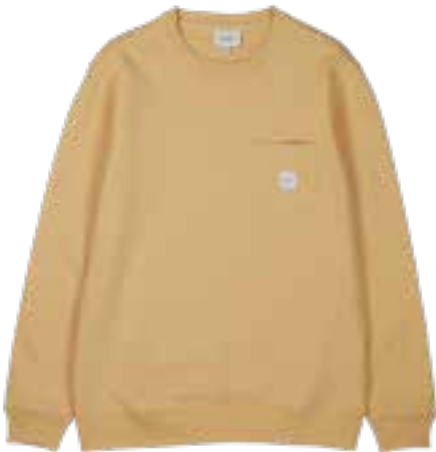
219 LIGHT OCHRE

M41073 | S - XXL | 100% ORGANIC COTTON | 320 g/m² FRENCH TERRY | MADE IN TURKEY