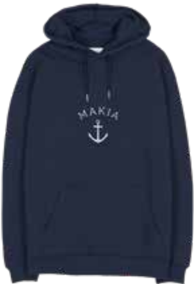
661 DARK BLUE

M40095 | S - XXL | 100% ORGANIC COTTON | 360 g/m² FLEECE | MADE IN TURKEY