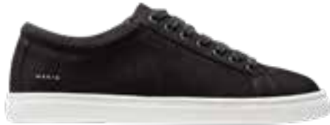
998 BLACK NOBUCK UPPER VEGETABLE TANNED LEATHER LINING