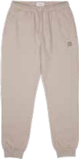
123 LIGHT BEIGE

M70016 | S-XL | 100% ORGANIC COTTON | 260g/m² FLEECE | MADE IN TURKEY