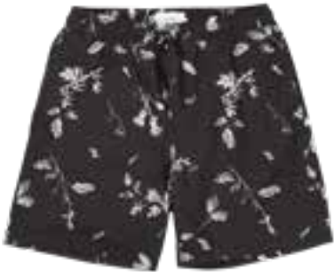
Carduus shorts M72020_999 BLACK | 30, 32, 34, 36 50% ORGANIC COTTON 50% LINEN | 150g/m² MADE IN TURKEY