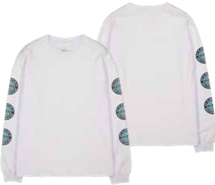
Björkö long sleeve CP_U22004_001 WHITE | XS - XXL 100% ORGANIC COTTON | 230g JERSEY MADE IN TURKEY