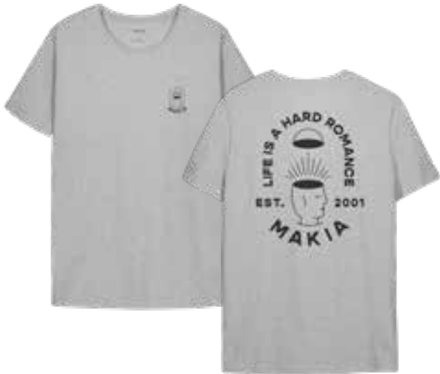
921 LIGHT GREY

M21340 | S - XXL | 60% RECYCLED COTTON 40% RECYCLED PES | 180 g/m² JERSEY | MADE IN INDIA