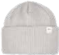
916 LIGHT GREY

U82052 | ONE SIZE | 100% MERINO WOOL | MADE IN FINLAND