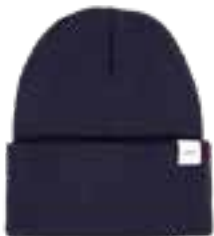
683 DARK NAVY