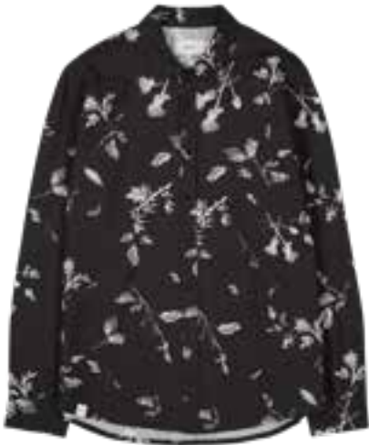
Carduus shirt M60146_993 BLACK | S - XXL 50% ORGANIC COTTON 50% LINEN | 150g/m² MADE IN TURKEY