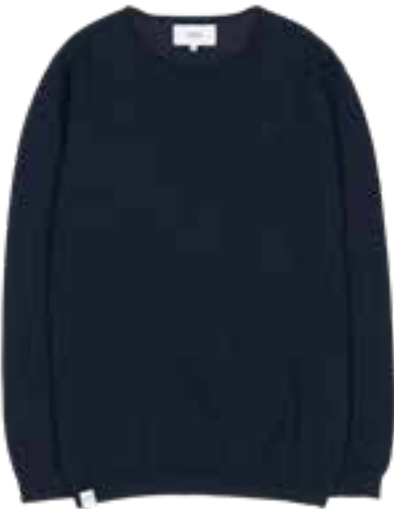
683 DARK NAVY