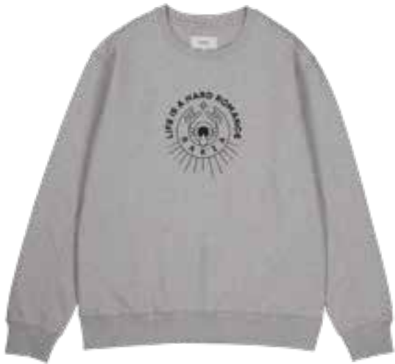
921 LIGHT GREY

M41149 | S - XXL | 60% RECYCLED COTTON 40% RECYCLED PES | 280 g/m² FLEECE | MADE IN INDIA