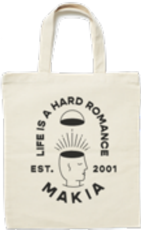
Life tote bag U87058_003 ECRU | ONE SIZE 70% RECYCLED COTTON 30% RECYCLED PET MADE IN CHINA