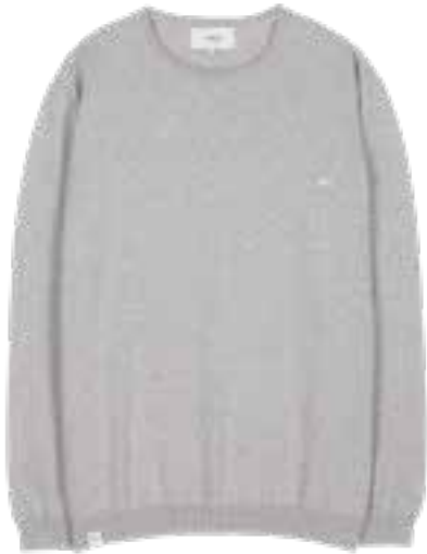
914 LIGHT GREY

M50063 | S - XXL | 100% ORGANIC COTTON | 14 GAUGE KNIT | MADE IN TURKEY