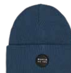
665 NORDIC BLUE