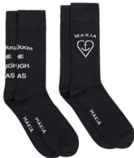
Glenn two pack of socks

U83004_000 ASSORTED | 35-38, 39-42, 43-46 80% COTTON 18% POLYAMIDE 2% ELASTANE MADE IN PORTUGAL