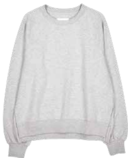
910 LIGHT GREY

W41037 | XS - XL | 100% ORGANIC COTTON, CERTIFIED BY GOTS | 260 g/m 2 FLEECE | MADE IN TURKEY