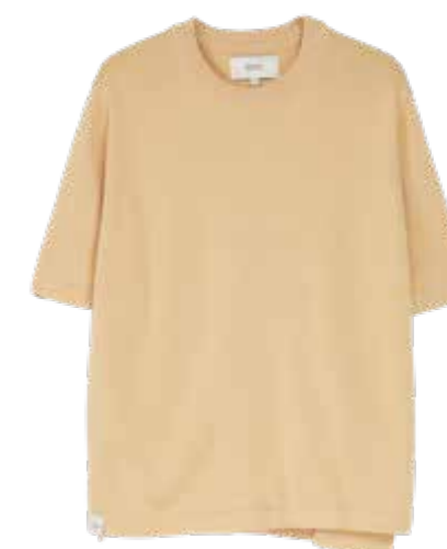
219 LIGHT OCHRE