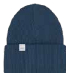
665 NORDIC BLUE