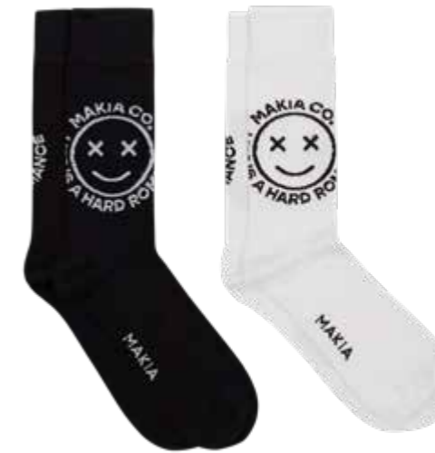
Dizzy two pack of socks

U83001_999 BLACK | 35-38, 39-42, 43-46 80% COTTON 18% POLYAMIDE 2% ELASTANE MADE IN PORTUGAL