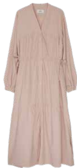
417 LIGHT DUSK

W75048 | XS - XL | 100% RECYCLED POLYESTER | 122 g/m 2 CREP FABRIC | MADE IN TURKEY