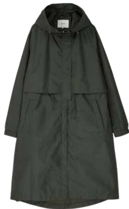
789 DARK GREEN