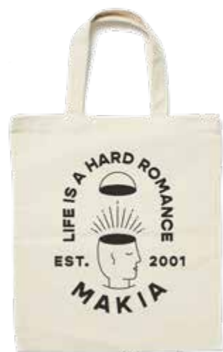
Life tote bag

U87058_003 ECRU | ONE SIZE 70% RECYCLED COTTON 30% RECYCLED PET MADE IN CHINA