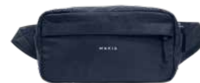
661 DARK BLUE