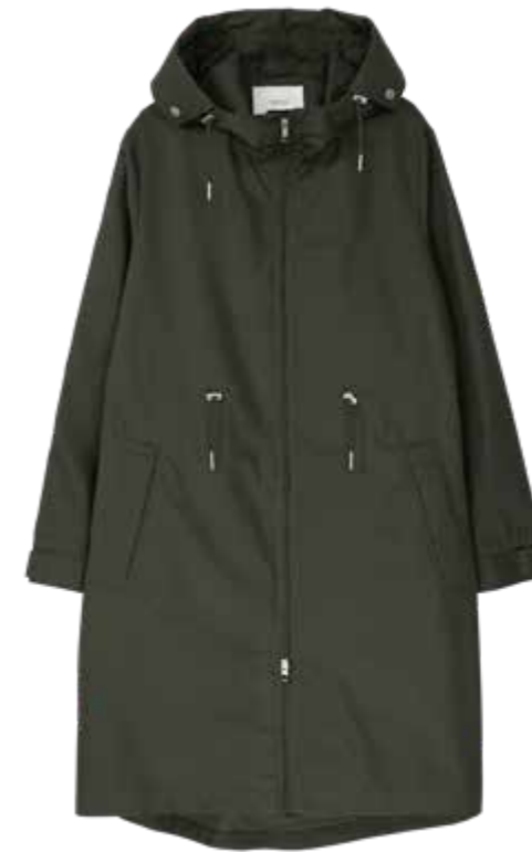
789 DARK GREEN