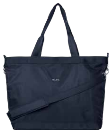
661 DARK BLUE