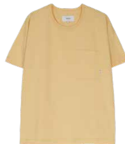
219 LIGHT OCHRE

W24026_219 SAHARA-WHITE | XS - XL 100% ORGANIC COTTON | 150 g/m 2 JERSEY MADE IN TURKEY