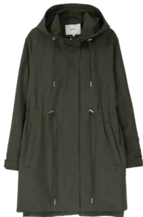
789 DARK GREEN