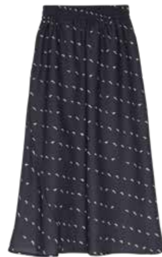
987 DARK GREY

W71015 | XS - XL | 100% RECYCLED POLYESTER | 122 g/m 2 CREP FABRIC | MADE IN TURKEY