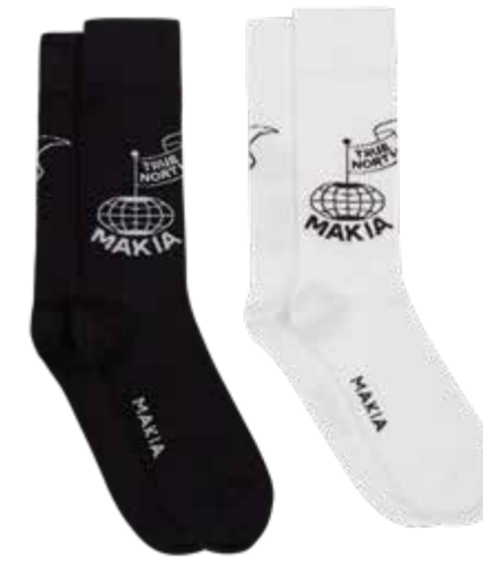
True north two pack of socks

U83003_999 BLACK | 35-38, 39-42, 43-46 80% COTTON 18% POLYAMIDE 2% ELASTANE MADE IN PORTUGAL