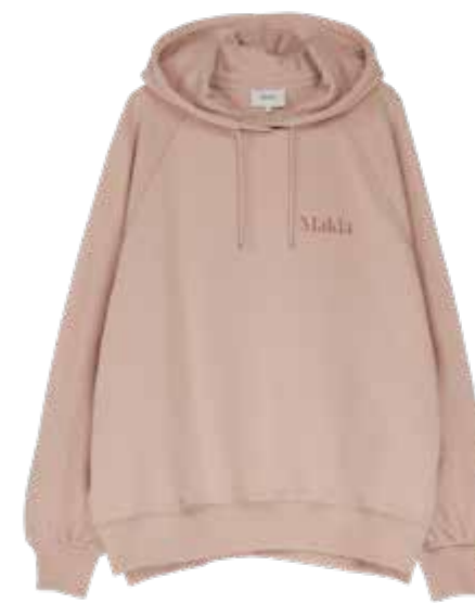
417 LIGHT DUSK