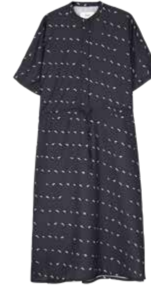
987 DARK GREY

W75047 | XS - XL | 100% RECYCLED POLYESTER | 122 g/m 2 CREP FABRIC | MADE IN TURKEY