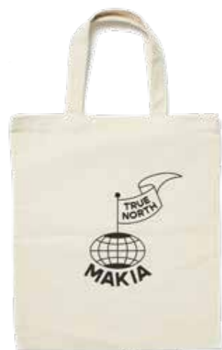
North tote bag

U87058_003 ECRU | ONE SIZE 70% RECYCLED COTTON 30% RECYCLED PET MADE IN CHINA