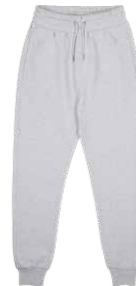
910 LIGHT GREY

W70010 | XS - XL | 100% ORGANIC COTTON | 260 g/m 2 FLEECE | MADE IN TURKEY