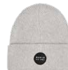
914 LIGHT GREY