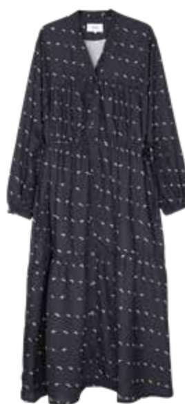
987 DARK GREY