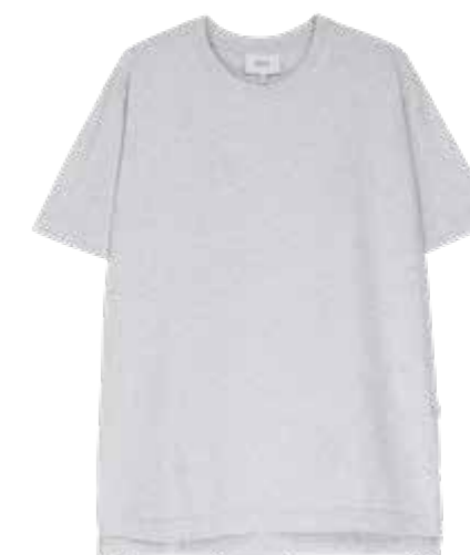
910 LIGHT GREY