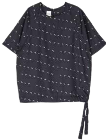
987 DARK GREY