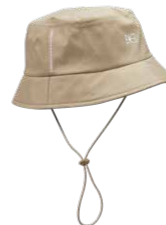
126 LIGHT CAMEL