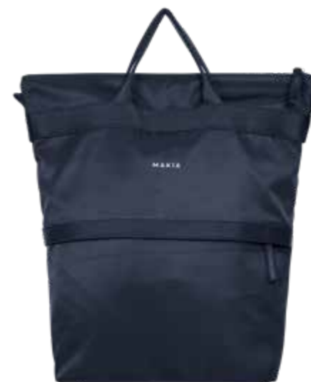
661 DARK BLUE