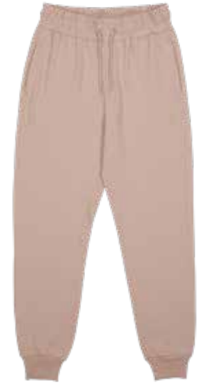
417 LIGHT DUSK