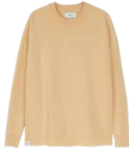
219 LIGHT OCHRE