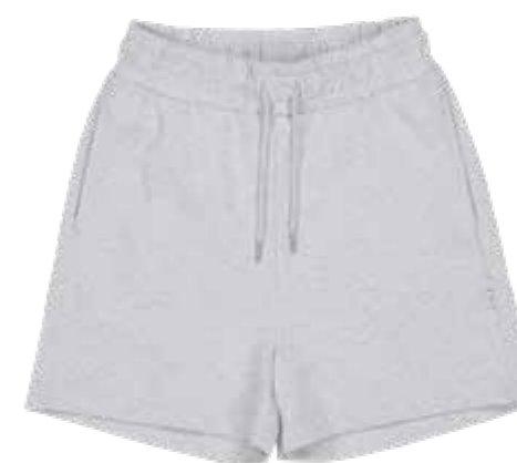
910 LIGHT GREY