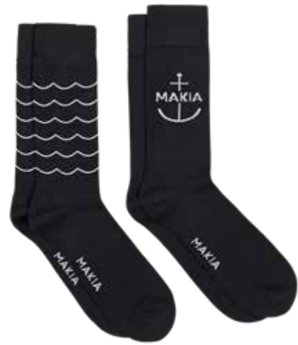
Frey two pack of socks

U83001_999 BLACK | 35-38, 39-42, 43-46 80% COTTON 18% POLYAMIDE 2% ELASTANE MADE IN PORTUGAL