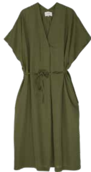
Mila Kaftan dress