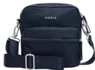
661 DARK BLUE