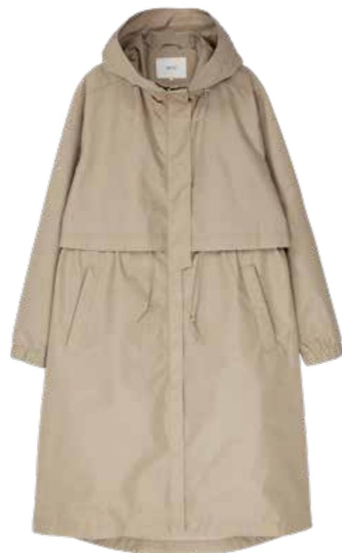
126 LIGHT CAMEL