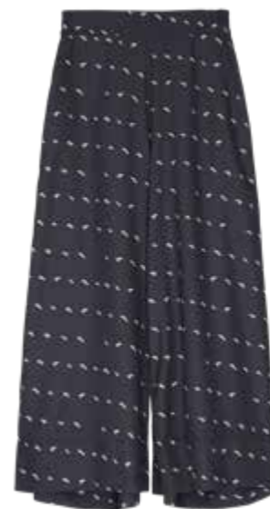
987 DARK GREY

W70014 | XS - XL | 100% RECYCLED POLYESTER | 122 g/m 2 CREP FABRIC | MADE IN TURKEY