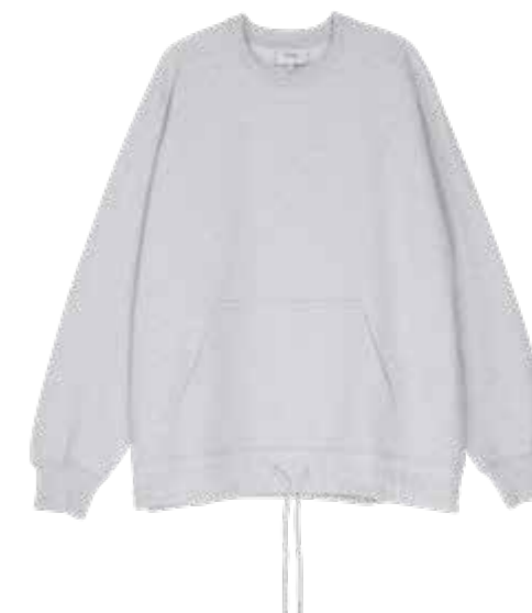
910 LIGHT GREY