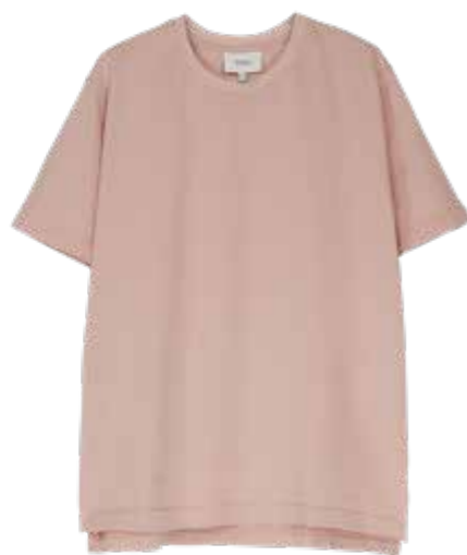
417 LIGHT DUSK