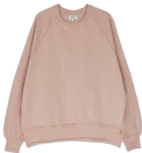
417 LIGHT DUSK

W41037 | XS - XL | 100% ORGANIC COTTON, CERTIFIED BY GOTS | 260 g/m 2 FLEECE | MADE IN TURKEY