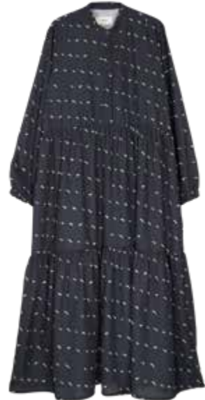
987 DARK GREY

W75037 | XS - XL | 100% RECYCLED POLYESTER | 122 g/m 2 CREP FABRIC | MADE IN TURKEY