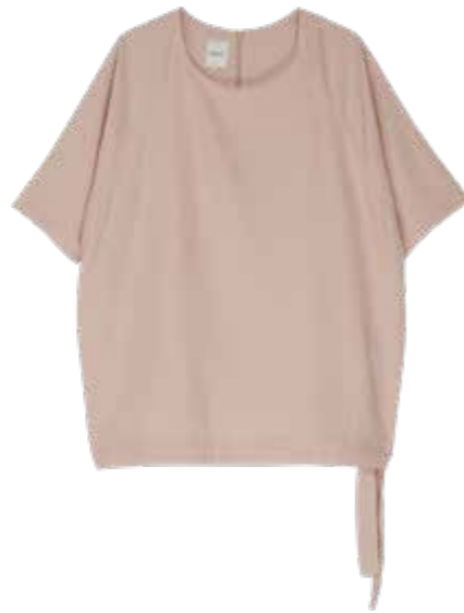
417 LIGHT DUSK

W61010 | XS - XL | 100% RECYCLED POLYESTER | 122 g/m 2 CREP FABRIC | MADE IN TURKEY